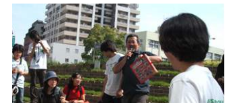
Fig. 3 Children look forward to the toy auction, where they can bid on popular toys with their "Kaeru" points.