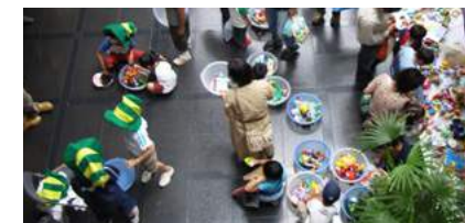
Fig. 1 An array of toys that children brought to the event. Children can exchange their "Kaeru" points for toys.