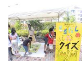
Fig. 2 Children who participate in the disaster drill program can earn "Kaeru" points