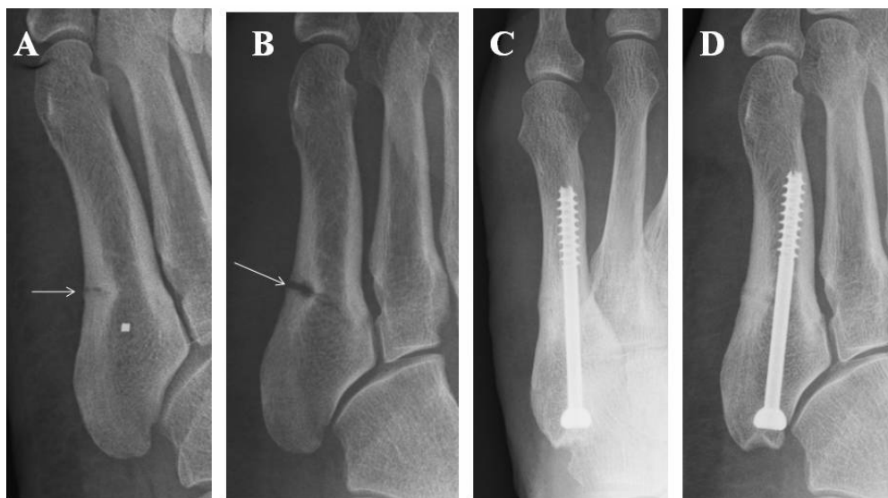
Figure 2. Radiographs of left foot before surgery (A and B) and after surgery (C and D).

three months. In addition, treatment with LIPUS to the fracture site of the fifth metatarsal bone using SAFHS (Sonic Accelerated Fracture Healing System, Teijin Pharma Ltd., Tokyo, Japan) was administered for 20 minutes a day for 6 months after surgery. At postoperative one year, the patient could walk without pain in the knee and foot and bone union at the fracture site of the fifth metatarsal bone was confirmed by radiographs (Figure 2 C, D). During the postoperative two-year follow up, he had no complaints in the knee or foot.