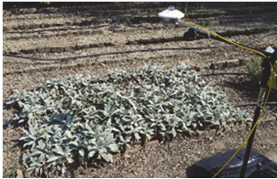
Figure 2. Measurement of canopy albedo on Stachys byzantina according to ASTM E1918-16 (2016) (Modena, September 2016)